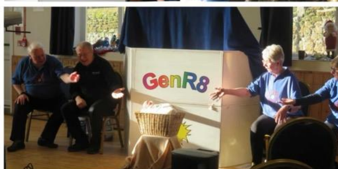
Christmas West Norfolk team

Four teams in Cambridgeshire and North Hertfordshire, along with the West Norfolk affiliate team, took the message of Jesus into primary schools. Thanks to all our faithful assembly volunteers, old and new!