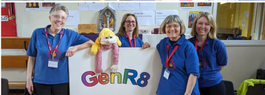
Easter assembly teams