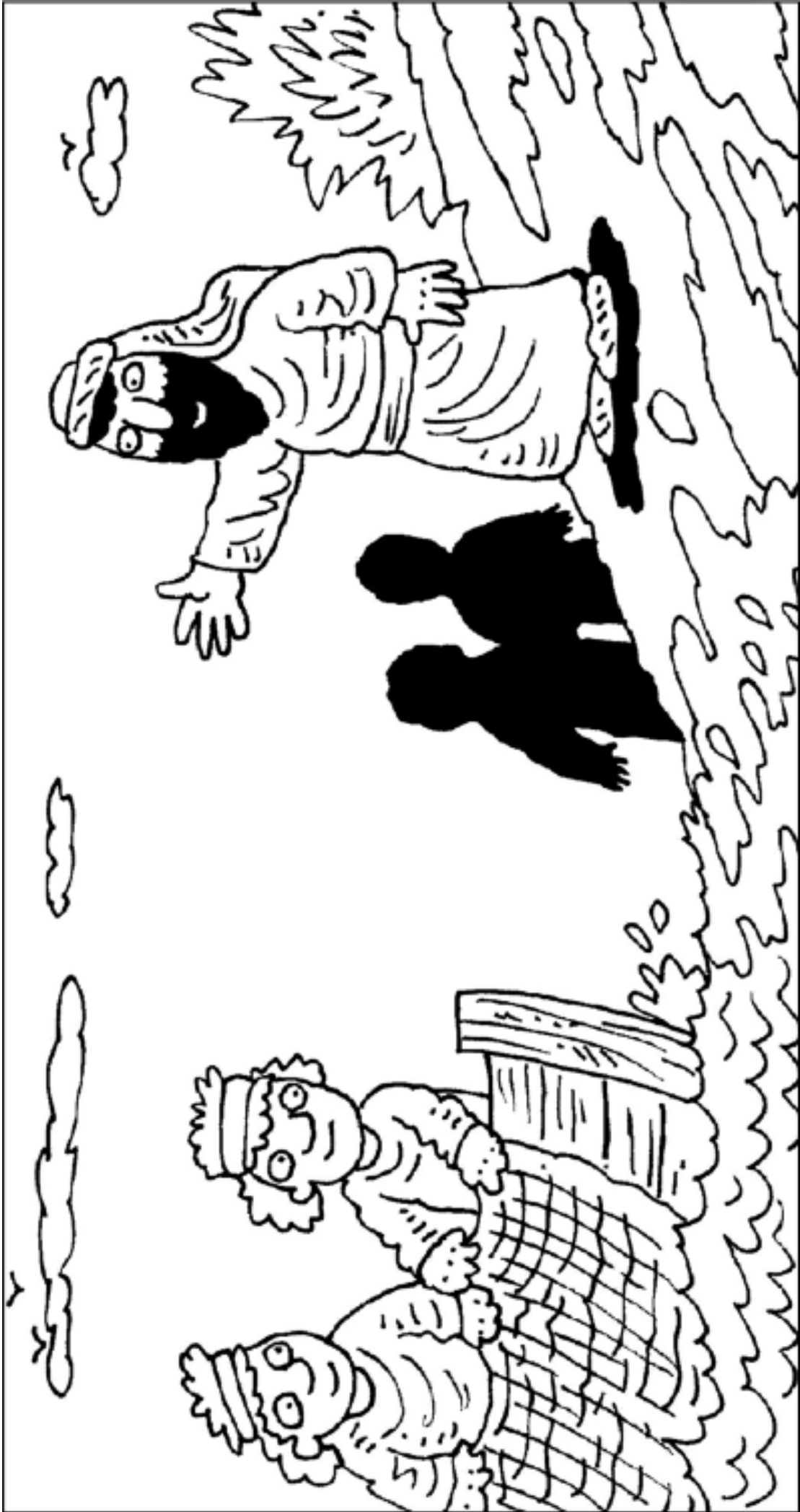
Peter and Andrew left their fishing and their families and followed Jesus.