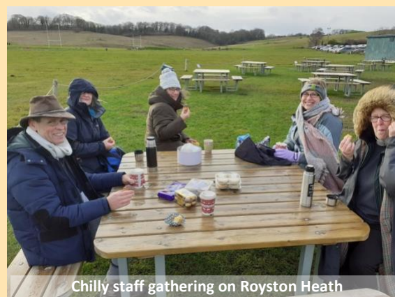
Chilly staff gathering on Royston Heath